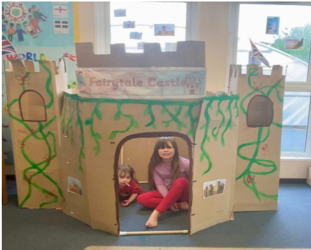
Some photos of last half term